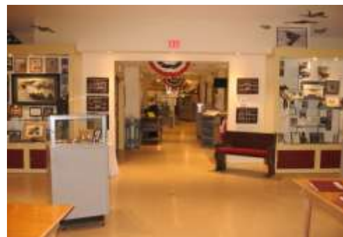
View from inside 1,860 square-foot annex.

Since then, donations continue to pour in. Museum staff has been working overtime to keep up with all the new items to catalog and put on display. Our thanks go out to everyone for their support and patience during this time. We hope everyone has a chance to see the new space soon.